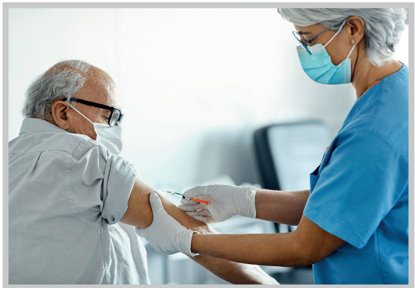
Providers say they are in a race to achieve herd immunity in their communities.