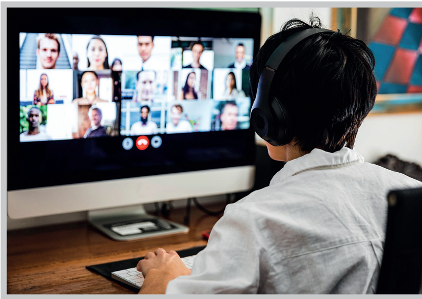
Successful providers will mount campaigns against misinformation, experts say.

from both residents and their families. But even more indicative would be outer-community spread of the virus, where social distancing and safety precautions were more lightly followed.