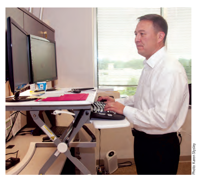
NIC plans to build on existing strengths while improving market data.