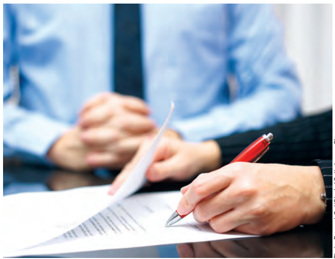
As lending practices tighten, operations are getting more scrutiny.

The TARP Accountability Act poured extra money into state Medicaid coffers during the 2007-08 financial crisis.