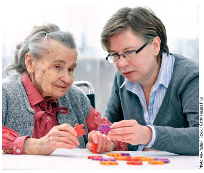
Memory care is one of the hottest services in the market.