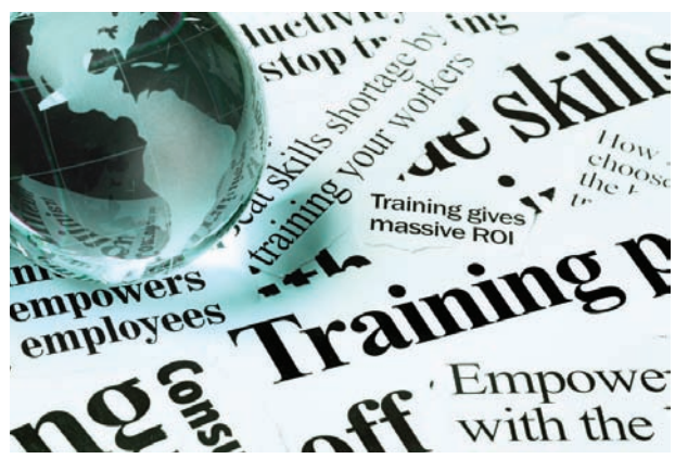
SunDance's new consulting division offers scholar and training programs that provide CE credits. It is one of the newest innovative wrinkles that illustrate the "SunDance Difference."

In addition, SunSolutions Consulting provides customized services based on individual customer needs. Here is a sampling of onsite consultative offerings that facilitate provider solutions