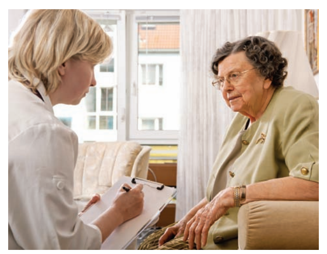
Providing follow-up cognitive testing is just one strategy SunDance therapists use to treat individuals with memory loss.

leading cause of death in Americans aged 65 years or older.